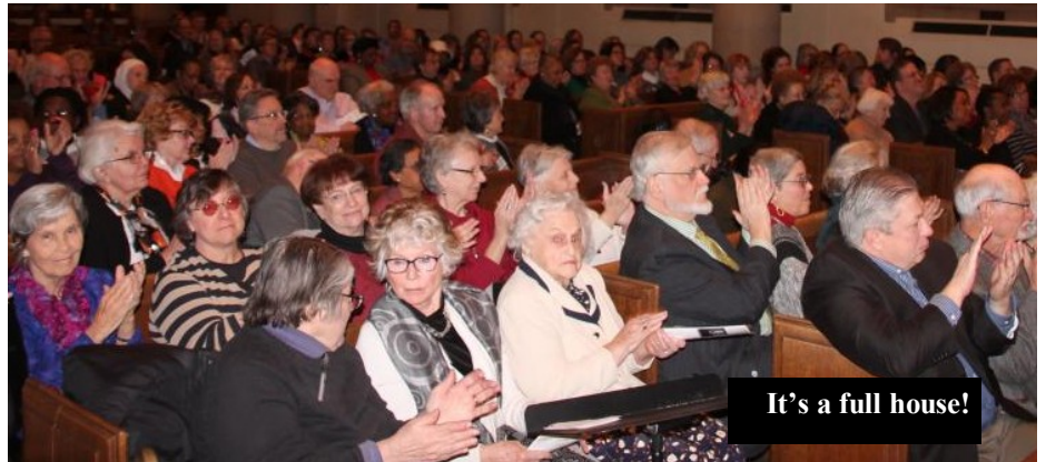
It's a full house!