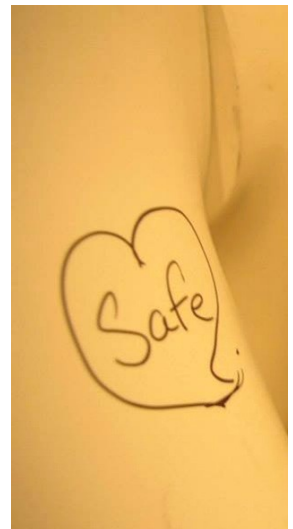
Detail from the Exhibit "Finding Voice"