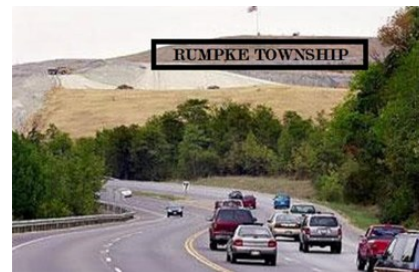
Mt. Rumpke along I-275 now dubbed by residents as "Rumpke Township" since Rumpke funded all 3 township races. The Cincinnati Post , Dec. 2021

Rumpke's landfill is one of the largest in the country and by far the biggest landfill in Ohio. It contains 63 million tons of waste and the capacity to add another 100 million tons according to the Environmental Protection Agency. As much as 43% of the waste in Rumpke's Hamilton County landfills comes from outside the county. Rumpke seeks to expand the facility further in order to be able to increase the amount of solid waste it stores.