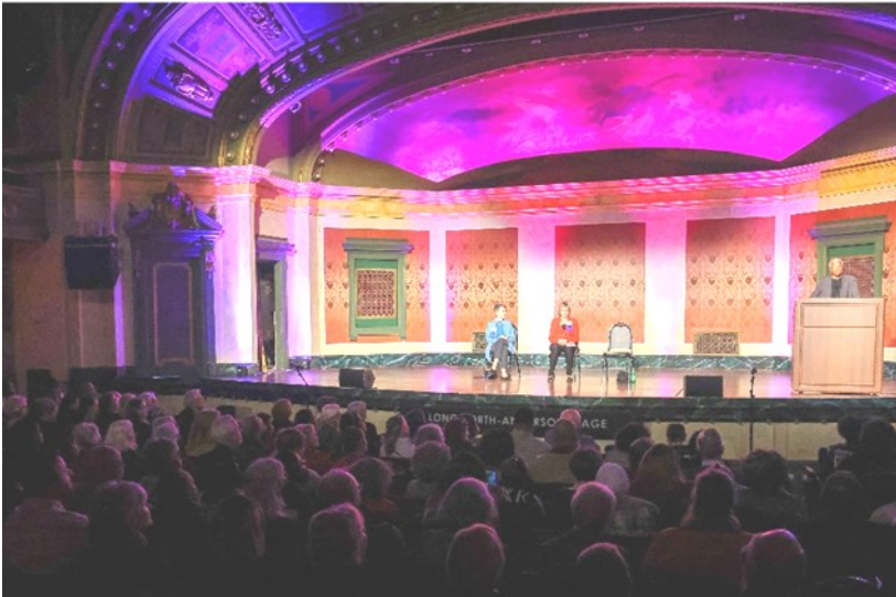
Memorial Hall Vista